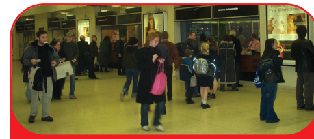
Winners and losers in timetable changes

However, changes to CrossCountry services mean that some passengers will find they need to change trains to complete their journeys. As well as Birmingham New Street, there will be alternative interchange options. Passenger Focus encouraged the Department for Transport to insist bidders for the new franchise had an interchange